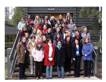
The Women in Numbers Workshop at Banff, Alberta

The Women in Numbers Workshop provided a unique effort to help raise the profile of active female researchers in number theory and increase their participation in research activities in the