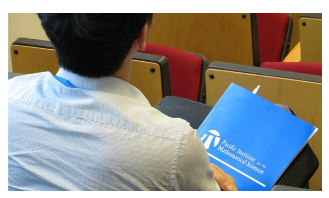
Deadline Tonight: Event, Conference, Activity Proposals